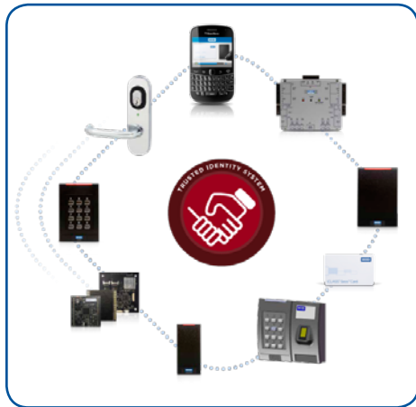
iCLASS SE® Platform