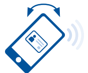
Twist & Go