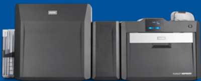
Dual-sided printer/encoder with optional lamination